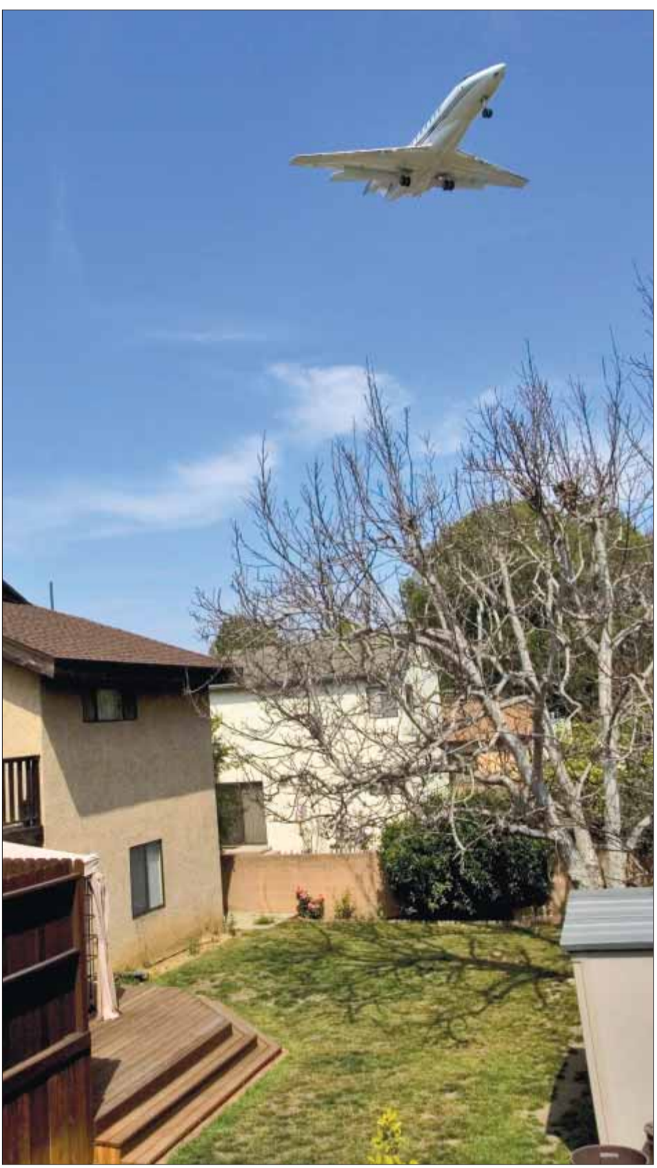
TOO CLOSE FOR COMFORT: A private jet fly's overhead on its way to the Santa Monica Airport on Monday afternoon. The City Council is expected tonight to spend $242,261 to maintain a noise monitoring system at SMO.